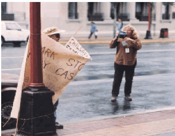
Social worker taking photo of protestor.