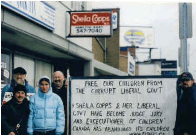
Another view of protestors. Since I download these photos in early 2006, they no longer exist in the web site where I found them.