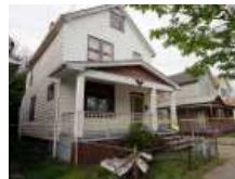
Chilling details emerge from Cleveland of more...