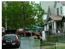
'He locked my sister in a box and beat her': Ex-wife's family...