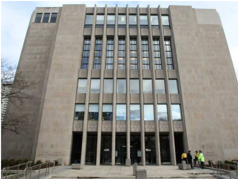
Superior Court in Toronto