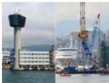
Seven dead as cargo ship slams into Genoa port and topples...