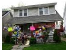
Shocking new details emerge of 'sexual torture chamber' as...